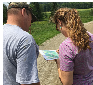
Technical assistance provided by the Orleans County Natural Resources Conservation District to a small farmer in the Lake Memphremagog watershed.