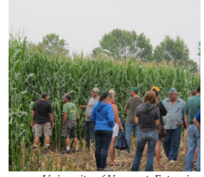
University of Vermont Extension Service hosts an on-farm educational event to discuss conservation practices and results with agricultural operators.