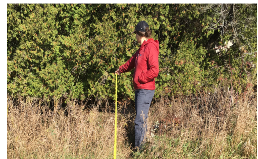
VAAFMM water quality farm specialist measures the distance of an annual crop field perennial buffer during an inspection.

34 LFOs 114 MFOs 310 CSFOs NUMBERS OF OPERATIONS OF VARYING SIZES PERMITTED WITH VAAFMM 91 APPLICATORS CERTIFIED CUSTOM MANURE APPLICATORS 1240 FARM VISITS FOR WATER QUALITY INSPECTION AND TECHNICAL ASSISTANCE 115 ENFORCEMENT ACTIONS ASSOCIATED WITH 179 ALLEGED VIOLATIONS