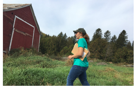
VAAFMM water quality farm specialist assesses areas adjacent to barn during an inspection.

VAAFMM referred several cases to the Vermont Attorney General's Office (AGO) for civil enforcement in FY19 and the AGO is working to obtain corrective action and monetary penalties. A further 38 farms were referred to the Agency of Natural Resources, Department of Environmental Conservation (ANR DEC) for suspected point source discharges to surface water. For penalty amounts related to these cases, please contact ANR DEC.