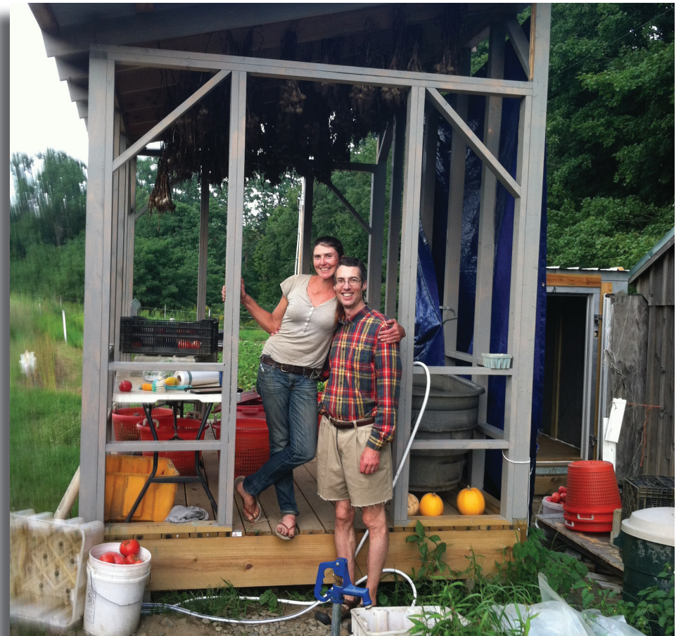
New Leaf CSA was awarded $9,502 to upgrade their wash/pack house to a covered facility, and a cold storage unit, and install stainless-steel counters and sink for produce washing and handling.

“ The new structure eliminates the risk of contamination from overhead and the stainless steel sink and counters can be thoroughly cleaned and sanitized.