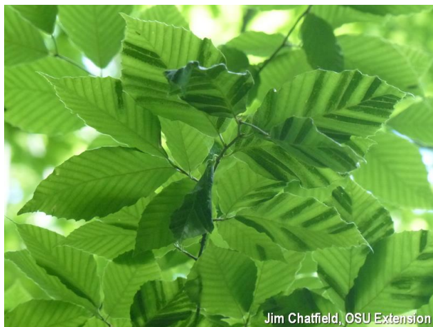
Jim Chatfield, OSU Extension

Symptoms start as dark interveinal banding in the foliage. The banding is often a common symptom of foliar nematodes because they are typically limited by leaf veins. These leaves can become thickened and leathery with curled edges as the season progresses. The symptoms move into the crown of the tree resulting in leaf drop, thinning crowns, poor vigor and over a matter of a few years, death.