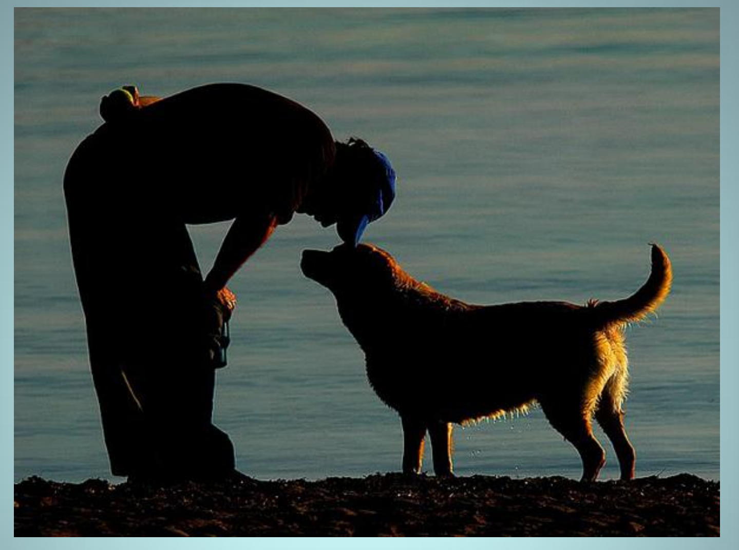
"The greatness of a nation and its moral progress can be judged by the way its animals are treated."