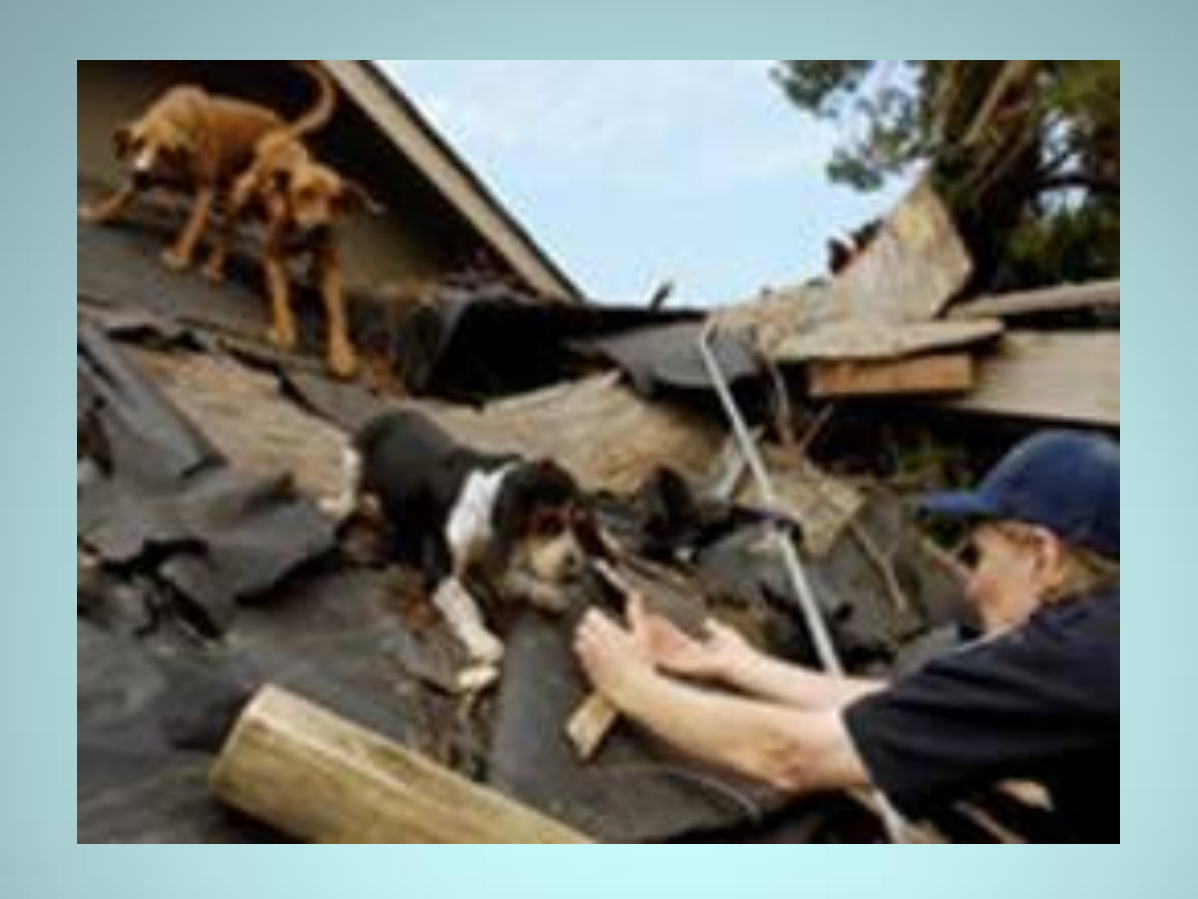
This issue is important because...

Successful emergency response plans for people often depend on the plans for those peoples' pets